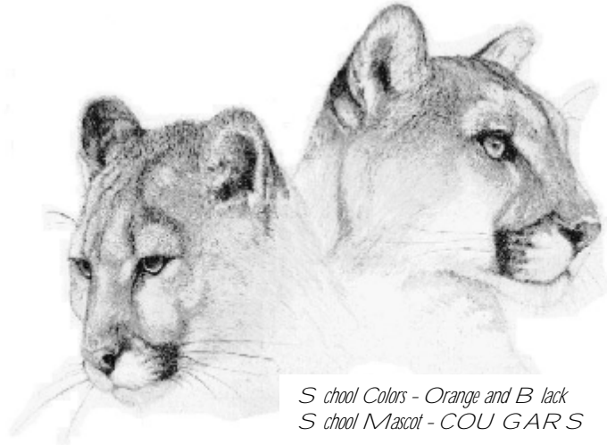
School Colors - Orange and Black School Mascot - COUGARS